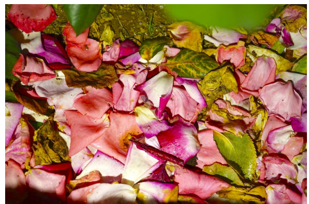
from the series Across the Sea, or Beyond the Night