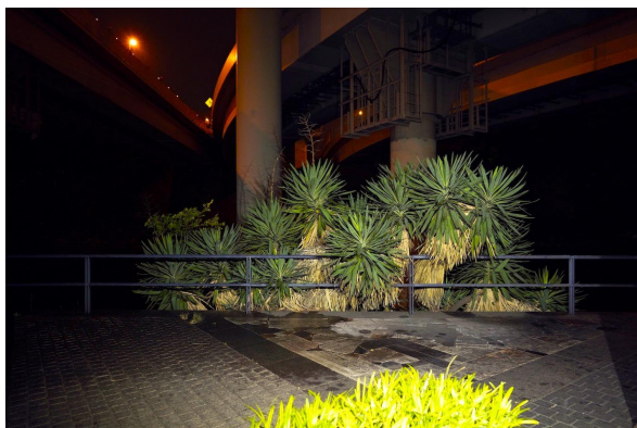
from the series Across the Sea, or Beyond the Night