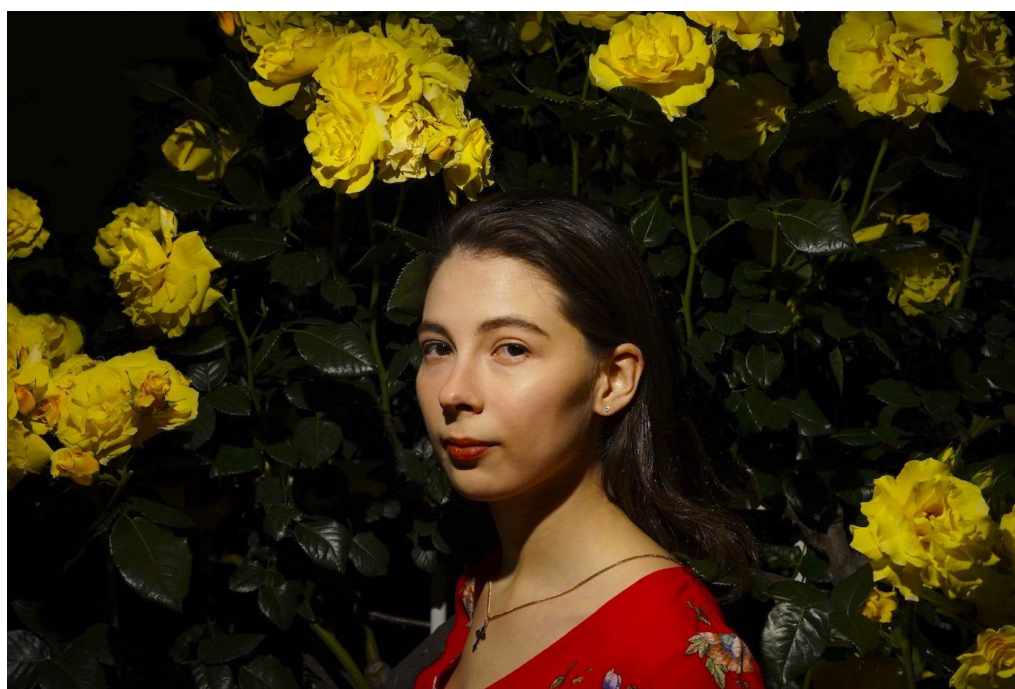
from the series Across the Sea, or Beyond the Night

2021 | archival pigment print