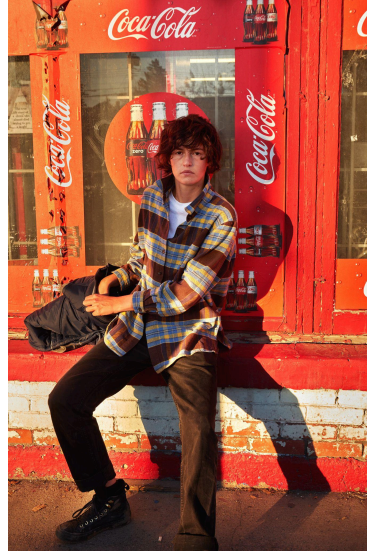
The True Life Story

from the series Beyond the Shadows 2019 | edition of 5 + 2AP semi-matt inkjet printing | 1080 × 720 mm