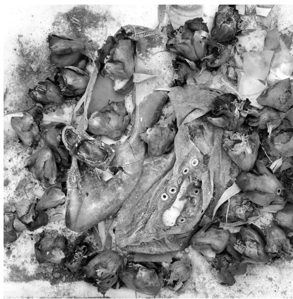
from the series, The Sea of Oblivion

© Shinichiro Uchikura, courtesy KANA KAWANISHI GALLERY