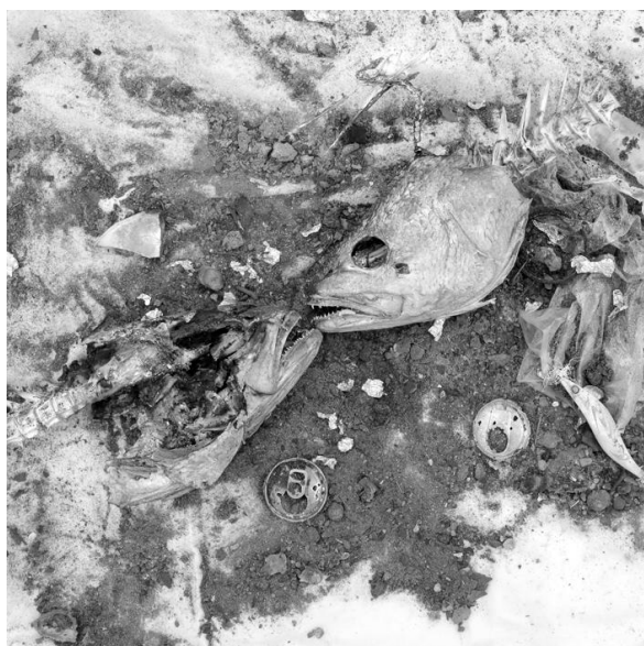
from the series, The Sea of Oblivion

2022 | archival pigment print