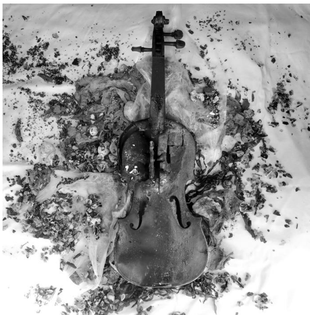
from the series, The Sea of Oblivion

*Kindly note the talk will be held in Japanese language only.