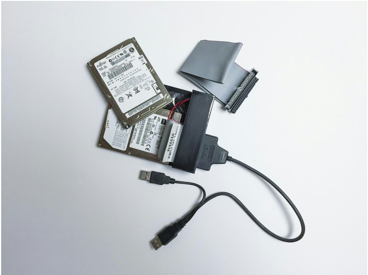
Invisible Existence (production footage image) 2016, mixed media © Hideo Anze, courtesy KANA KAWANISHI GALLERY

Another series unveiled for its first time on this occasion would be Invisible Existence series, which becomes Anze’s very first sculpture work. Themed on keywords such as “time” and “memory” which the artist had been focusing on in his previous photographic works, the series will feature objects such as secondhand Hard Disk Drives found with their memories already deleted.