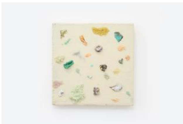
PP -drowsy poison-

2021 | glass specimen jar, others | w85 × d85 × h153 mm © Taichi Moriyama