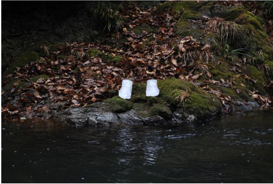
Into the River

2010 | © Taichi Moriyama, courtesy KANA KAWANISHI GALLERY