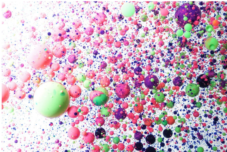
colored oil 081

2016, archival pigment print © Ryoichi Fujisaki, courtesy KANA KAWANISHI GALLERY