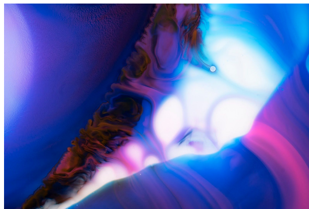
from the series colored oil