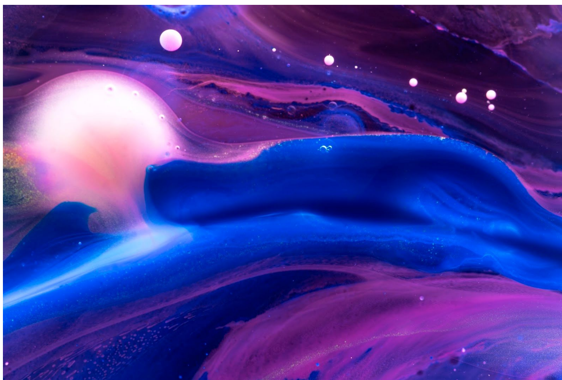
from the series colored oil

2020 | archival pigment print | © Ryoichi Fujisaki, courtesy KANA KAWANISHI GALLERY