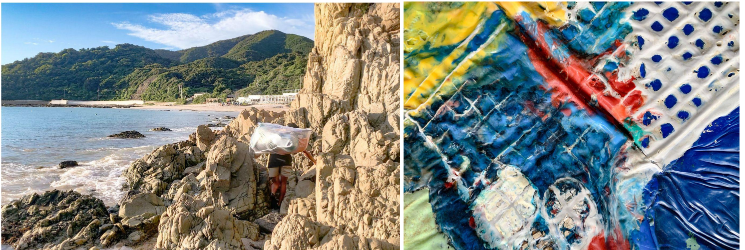
concept image for the exhibition, Mineralization 2023

KANA KAWANISHI GALLERY is pleased to present “Mineralization,” a solo exhibition by Akira Fujimoto starting October 21, 2023.