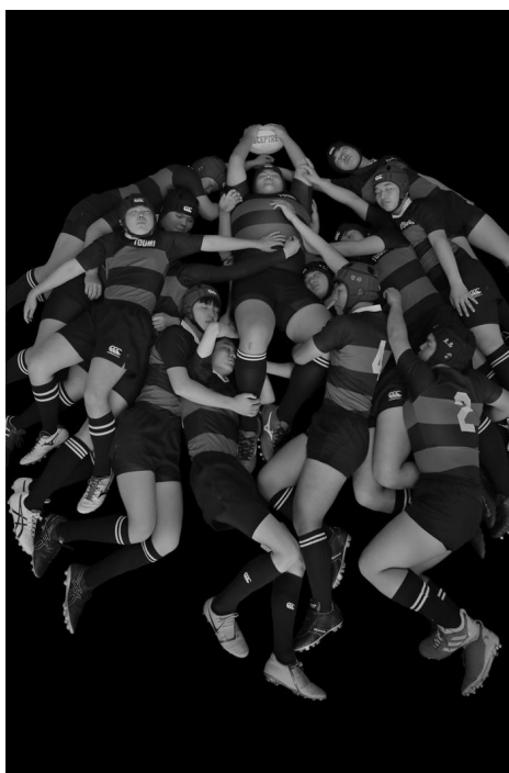
from the series, The Floating Portrait

*Kindly note the talk will be held in Japanese language only.