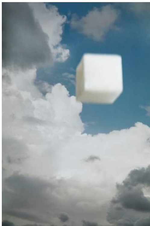
Human Wisdom no.1 2017 | archival pigment print | 480 × 320 mm

■Please contact below for any image enquiries■