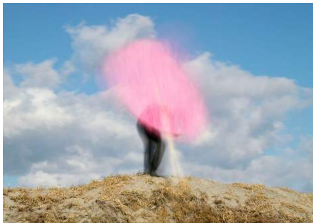
Landscape with a Rose Pink Curtain 2018 | archival pigment print | 630 × 900 mm © Yoshiki Hase, courtesy KANA KAWANISHI GALLERY

We look forward to cordially welcoming all to the new perspective of artwork the artist has found, where he accepts the wind and sunlight that fills the sky and the land as large components of his works, intaking the natural fluctuation offered by the universe.