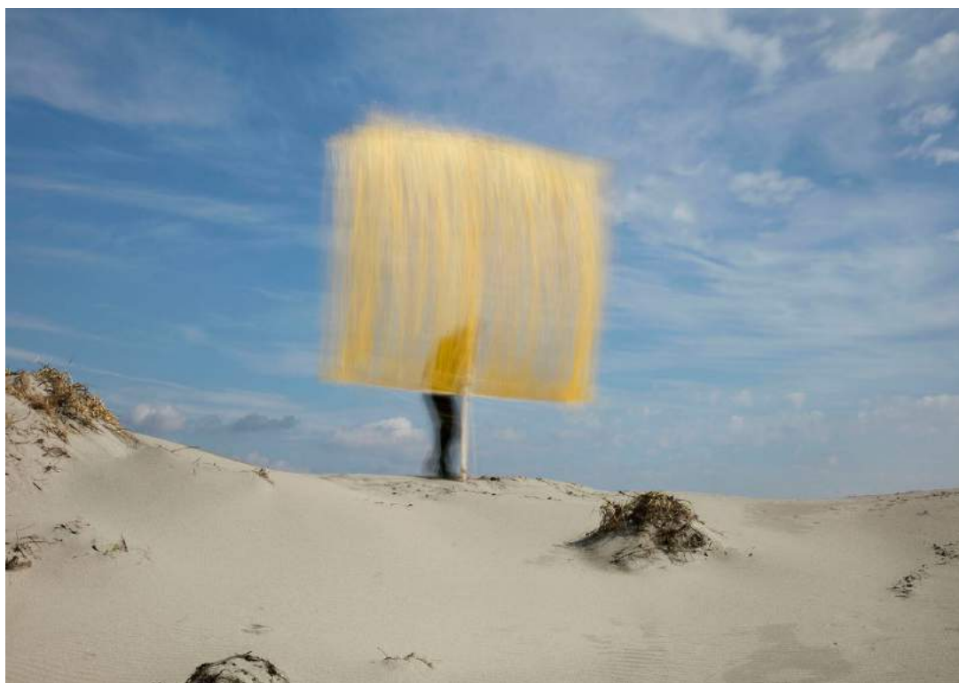
Landscape with a Yellow Curtain 1

2018 | archival pigment print | 630 × 900 mm | © Yoshiki Hase, courtesy KANA KAWANISHI GALLERY