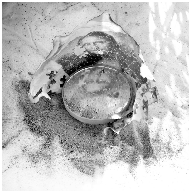
Mona Lisa and Mirror, from the series The Sea of Oblivion