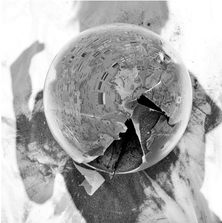
Globe, from the series The Sea of Oblivion

*Kindly note the talk will be held in Japanese language only.