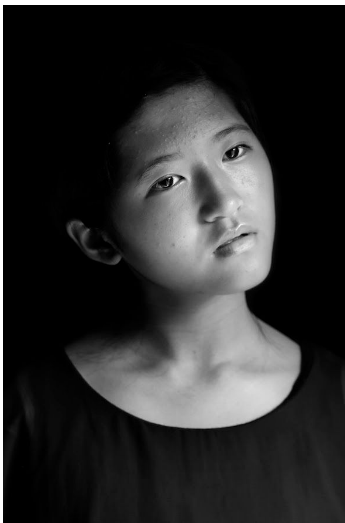
from the series My Portrait

2019 | archival pigment print | © Shinichiro Uchikura, courtesy KANA KAWANISHI GALLERY