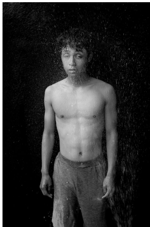
from the series My Portrait