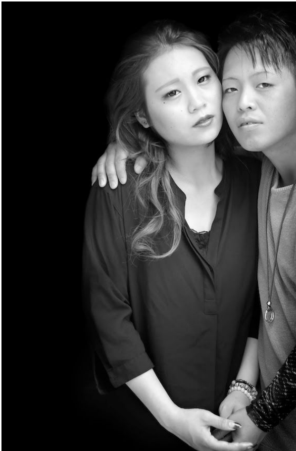
from the series My Portrait

The exhibition will disclose the profoundly deep world of portrait photography, that could be experienced only by physically looking at the prints themselves. We look forward to welcoming all to this exhibition along with the monograph that will be released on the opening day of the exhibition.