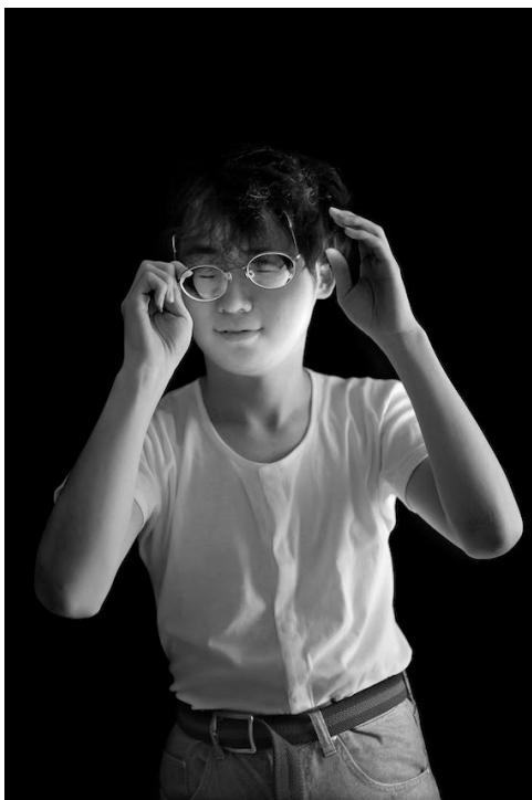
from the series My Portrait

© Shinichiro Uchikura, courtesy KANA KAWANISHI GALLERY