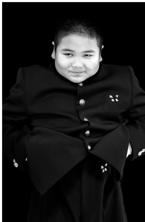
from the series My Portrait

© Shinichiro Uchikura, courtesy KANA KAWANISHI GALLERY