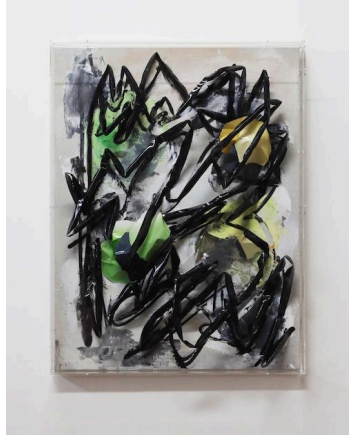
Picture(s) II #6 2025 | acrylic, analog chromogenic print on canvas (with acrylic frame) 663 × 512 × 84 mm