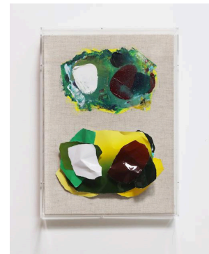
Picture(s) #127 2025 | Acrylic and analog chromogenic print on canvas (with acrylic frame) 343 × 253 × 68 mm