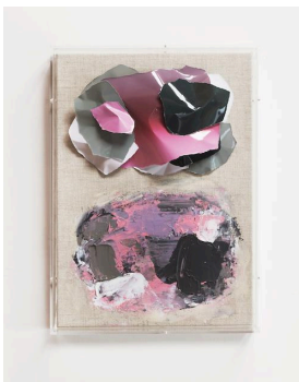
Picture(s) #112 2024 | Acrylic and analog chromogenic print on canvas (with acrylic frame) 343 × 253 × 68 mm