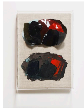
Picture(s) #126 2025 | Acrylic and analog chromogenic print on canvas (with acrylic frame) 343 × 253 × 68 mm