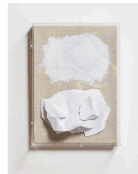
Picture(s) #119 2024 | Acrylic and analog chromogenic print on canvas (with acrylic frame) 343 × 253 × 68 mm

all images: © Kazuhito Tanaka, courtesy KANA KAWANISHI GALLERY