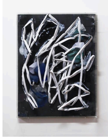
Picture(s) II #7 2025 | acrylic, analog chromogenic print on canvas (with acrylic frame) 663 × 512 × 84 mm