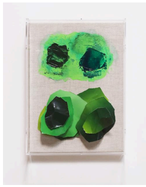
Picture(s) #123 2025 | Acrylic and analog chromogenic print on canvas (with acrylic frame) 343 × 253 × 68 mm