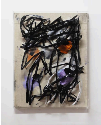
Picture(s) II #5 2025 | acrylic, analog chromogenic print on canvas (with acrylic frame) 663 × 512 × 84 mm