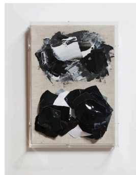
Picture(s) #115 2024 | Acrylic and analog chromogenic print on canvas (with acrylic frame) 343 × 253 × 68 mm