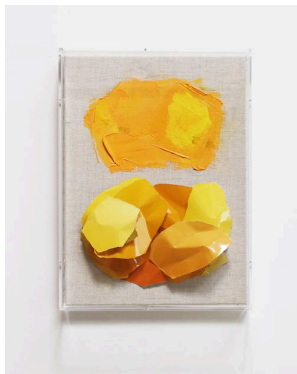
Picture(s) #122 2025 | Acrylic and analog chromogenic print on canvas (with acrylic frame) 343 × 253 × 68 mm