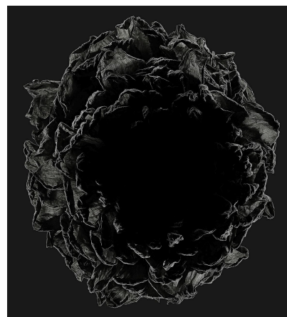
12_Dahlia / Eveline - Afterglow

2023 | archival pigment print | 1300 x 1100 mm