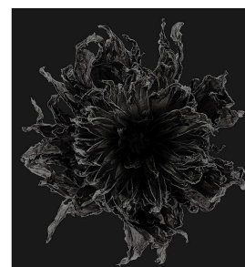
left: 13_Dahlia / Ben Huston - Bloom | 2020 right: 13_Dahlia / Ben Huston - Afterglow | 2023

all: archival pigment print | 750 x 610 mm © Kenji Toma, courtesy KANA KAWANISHI GALLERY