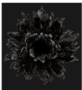
left: 17_Dahlia / Wildwood Marie - Bloom | 2020 right: 17_Dahlia / Wildwood Marie - Afterglow | 2023