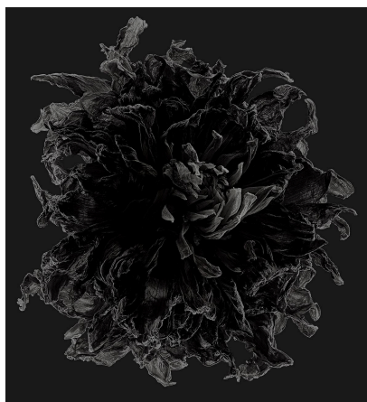
10_Dahlia / Caballero - Afterglow

While the beauty of colorful flowers is undeniable, this series deliberately focuses on withered flowers that have lost their freshness, presented in monochrome as large-format prints. In a world where contemporary life often seeks to challenge the natural order and the passage of time, these works confront these inevitable changes directly, allowing viewers to reflect on the weight and fleeting nature of life, while also evoking a thought-provoking sense of wonder.