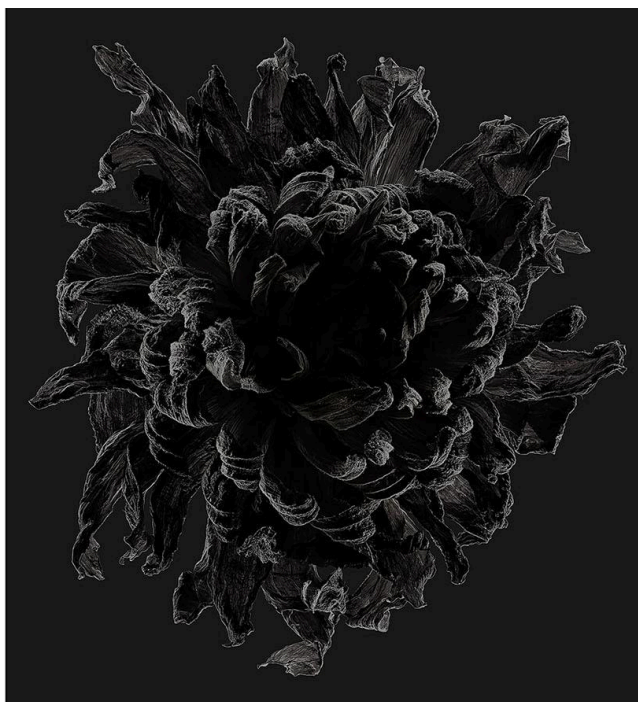
left: 15_Dahlia / Calient - Bloom | 2020 | archival pigment print | 750 × 610 mm right: 15_Dahlia / Calient - Afterglow | 2023 | archival pigment print | 750 × 610 mm © Kenji Toma, courtesy KANA KAWANISHI GALLERY

KANA KAWANISHI PHOTOGRAPHY is pleased to present Kenji Toma’s solo exhibition, “Thinking through Flowers / 11 Individuals,” opening Saturday, April 18, 2026.