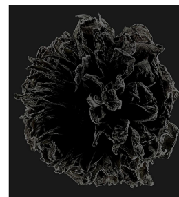
left: 08_Dahlia / Sheer Heaven - Bloom | 2020 right: 08_Dahlia / Sheer Heaven - Afterglow | 2023