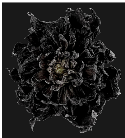
07_Dahlia / Spartacus - Afterglow